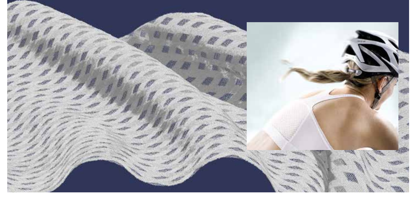
3D Simulation Warpknit gives you a never before seen reality of tricot fabric simulation.